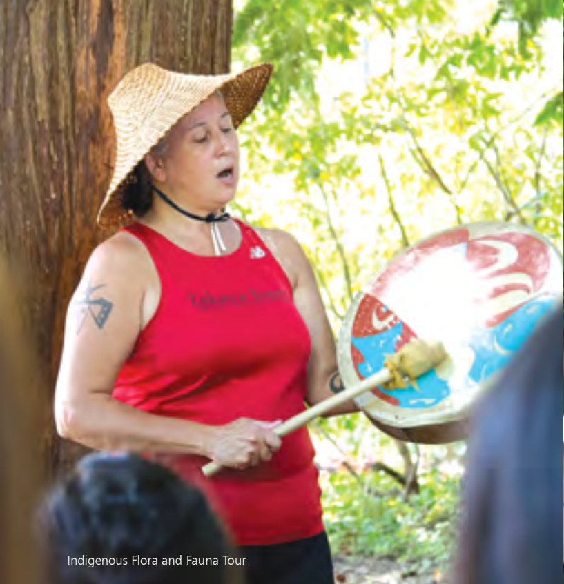
Indigenous Flora and Fauna Tour