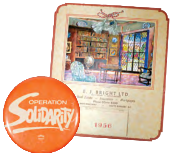
1950s promotional calendar (above) & Operation Solidarity button (left).