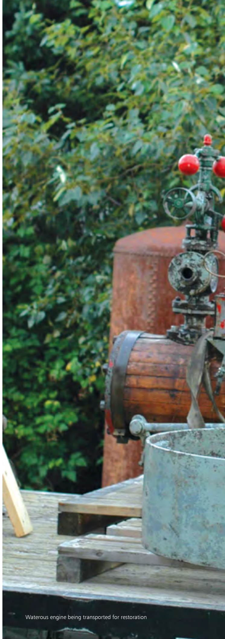
Waterous engine being transported for restoration

Conservation staff also kept exhibits clean and ensured our visitors enjoy the artifacts in the best condition possible.