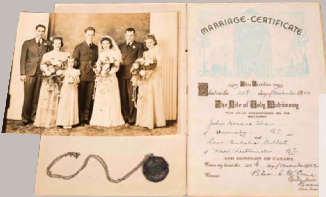
Shaw family artifacts