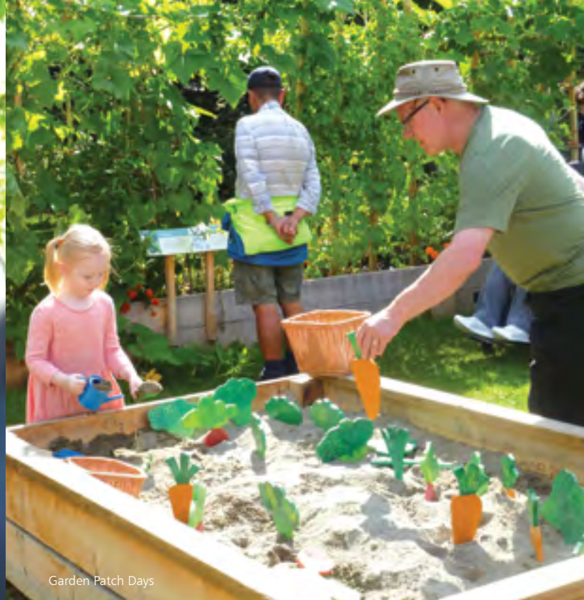
Garden Patch Days